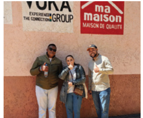
BUILDING & FUNDING SUPPORT BUMI