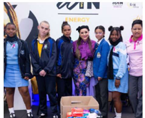
STATIONARY & ACADEMIC SUPPORT

ENQUIRE ABOUT YOUR SPEAKING OPPORTUNITY AND BE AMONG KEY INDUSTRY TRAILBLAZERS AT OUR WOMENIN FESTIVAL!