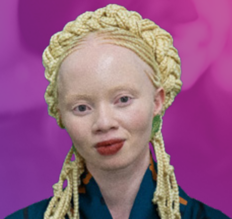
THANDO HOPA GLOBAL FASHION MODEL, DIVERSITY ADVOCATE & CULTURAL LEADER