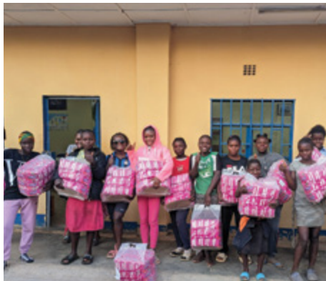
DRC GRASSROOTS HEALTH & WELLNESS