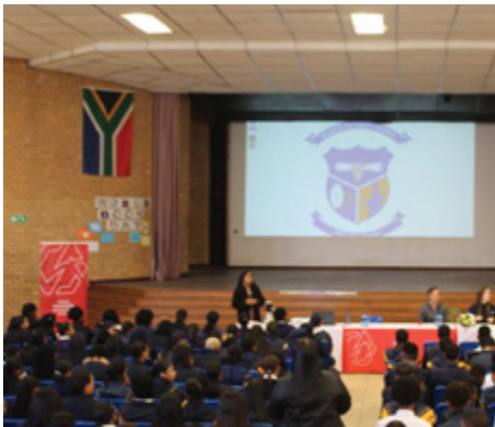
CAREER & HEALTH EDUCATION ROADSHOW WITH PARTNERS