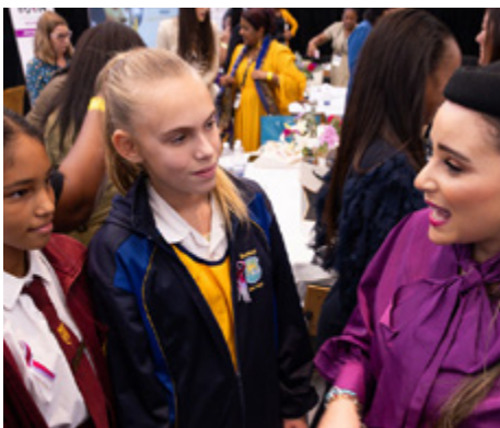
GIRLS IN STEM SUPPORT