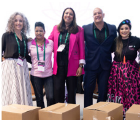
#AGAINSTPERIOD POVERTY CAMPAIGN